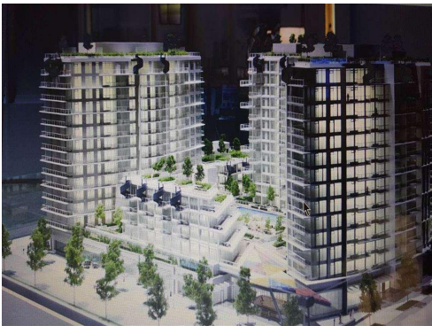
Northeast Tower Tower Home 609 2 Bedroom + Den Living 894 sf, Balconies 147 sf